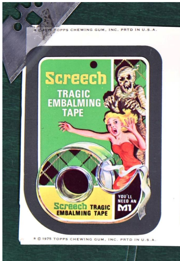
"Wacky Packages" 13th Series clear acetate white back sticker stock Image 03b

So, were these "Wacky Packages" 13 th Series clear acetate stickers ever tested? I have to assume they were indeed tested. Since both these stickers and the "Comic Book Heroes Stickers" clear acetate stickers originated from the Topps' Duryea plant, one can argue they were sent to the "Card Processing" department to be cut, collated and packaged for testing, otherwise, one would assume they would have gone to the Brooklyn office if they were just printed for proofing and review. We have no definite evidence of this for either issue however. I can envision Topps not die-cutting the stickers since the background was clear, but they did die-cut the "Comic Book Heroes Stickers" so it could go either way.