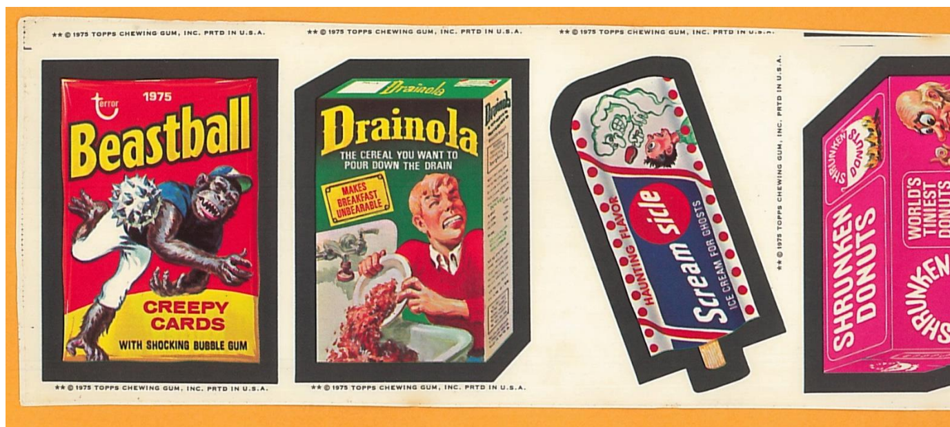
"Wacky Packages" 13th Series clear acetate stickers strip Image 03

The 13 th series of "Wacky Packages" were released around February/March of 1975 according to the wackypackages.org website, run by collector Greg Grant. Topps most likely printed these 13 th series acetate stickers from the same print sheet layout as the regular stickers, and probably around the same time or very soon after, if the same procedures took place as with the "Comic Book Heroes Stickers" acetates. Considering both these "Wacky Packages" and the "Comic Book Heroes Stickers", it is obvious Topps was experimenting with the clear acetate sticker stock, so it would be no surprise at all if other clear acetate issues (especially sports) eventually turn up. From my research, I've found Topps was tenacious when it came to experimenting and testing new ideas like cloth stickers, clear acetate stickers, size and format of cards and non-traditional novelty releases. They would try to use the new stock, size, format or novelty across both sports and non-sports releases in the hopes an issue would excel and be successful enough to fully release at retail.